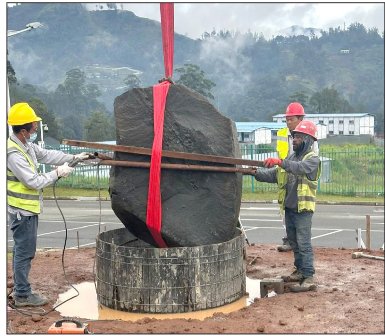
Preparing the plaque to be unveiled during the official opening next week Monday.