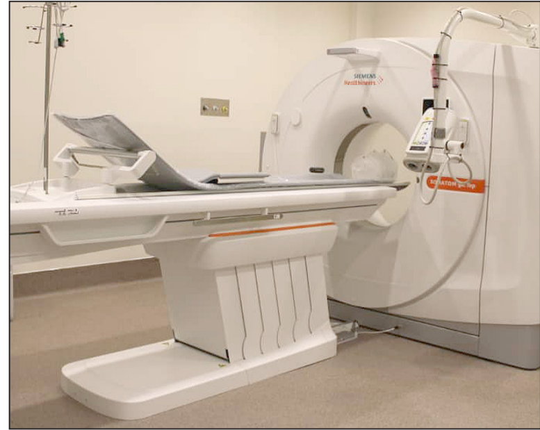
Computed Tomography (CT) Scan machine, one of the modern equipment for treating cancer patients ready for use after opening of the state of the art provincial hospital.